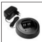
Rapid-rate Desktop Charger PMTN4025