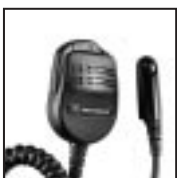
Remote Speaker Microphone PMMN4002