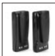
NiMH Battery & Belt Clip PMNN4008