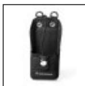
Nylon Carry Case HLN9701